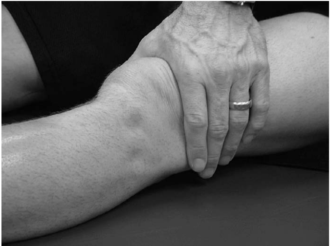
Figure 1. Correct examiner technique for the Clarke sign.

The examination technique known as the CS is described as a clinical technique used for the assessment of CP. 19,20,28,33,35–38 All participants were positioned supine with both lower extremities supported on the examination table. The examiner (R.L.R. performed all testing to eliminate inter-tester variability) then placed the web space of his thumb and index finger against the superior pole of the participant's pa-