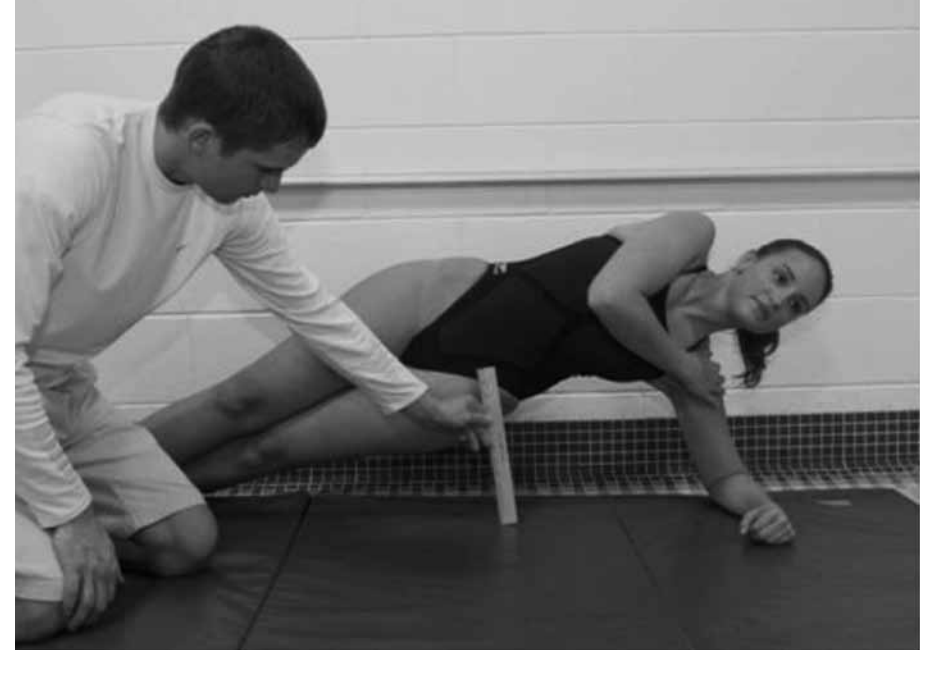
Figure 1. Timing for the side bridge test begins with the participant lying on her side on 1 elbow and both feet with the top foot in front and ends when her hips drop.

Station 5: Pectoralis Minor Length. Pectoralis minor length was measured with a PALM palpation meter (Performance Attainment Associates, St Paul, MN) using surface landmarks validated by Borstad<sup>18</sup> (Figure 2). The following landmarks were palpated and marked by the first author (A.T.): the inferior aspect of the sternal notch and the lateral aspect of the acromioclavicular joint, which represented the clavicle length; and the medioinferior aspect of the coracoid in the deltopectoral groove, which is the proximal pectoralis minor attachment. Next, the anteroinferior aspect of rib 4 one fingerwidth lateral to the sternum was identified, and the swimmer was instructed to hold her index finger on the spot while the investigator measured the distance from rib 4 to the coracoid process, which represented the pectoralis minor length at rest. Next, the swimmer was instructed to elevate her upper extremity to shoulder level and flex her elbow to 90° while placing her forearm on the doorjamb. She then was instructed to twist her trunk away from her upper extremity without moving her feet until she felt a strong stretch in her pectoral muscle. A second measurement from the coracoid to rib 4 was taken and represented the length of the pectoralis minor on stretch (Figure 2).<sup>19</sup> Normalized pectoralis minor length at rest and on stretch was obtained by dividing the pectoral length under each condition by the clavicle length.