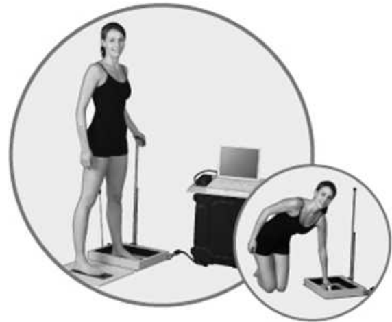
Figure 1. Perometer. A perometer uses arrays of light switches made up of light-emitting diodes to illuminate, scan, and calculate the volume of an extremity in milliliters (mL). Lower leg volume was calculated from the medial malleolus to the tibial tuberosity and was measured with the participant in a standing position.

Lower leg volume of both legs was measured with a perometer before, immediately after, and at 5 minutes and 30 minutes after both the 10-km run on the track and the maximum exercise test. A perometer uses arrays of light switches made up of light-emitting diodes to illuminate,