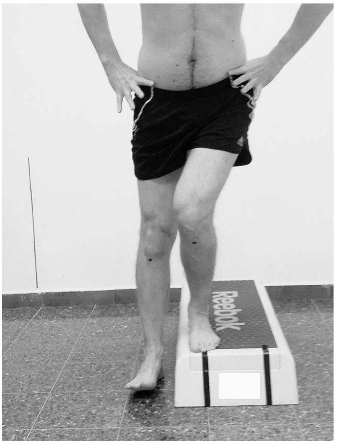
Figure 2. Moderate-quality movement pattern on the lateral stepdown test.

participants were classified as having a poor quality of movement (2 on the dominant-side LSD and 1 on the nondominant side), so we did not include their data in the primary statistical analysis.