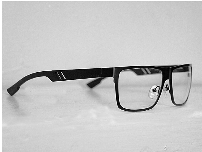
Figure 2. Computer gaming glasses (Gunnar Optiks, Rancho Santa Fe, CA).

syndrome. Decreasing the stimulation of these tissues may allow successful restoration of homeostasis within the system. The filtering of blue light may lessen the stimulation of the visual cortex by decreasing activation of the S cones.