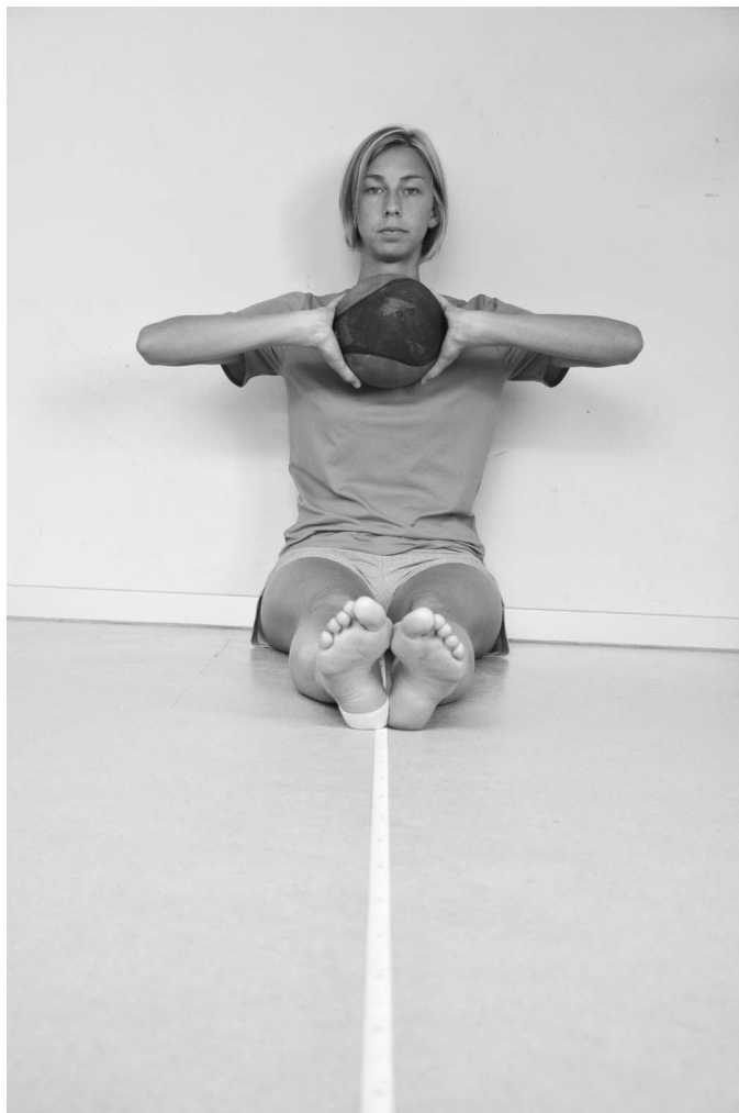
Figure 1. Starting position for the Seated Medicine Ball Throw.

correlated with the results of tests measuring core stability and upper extremity performance. 19