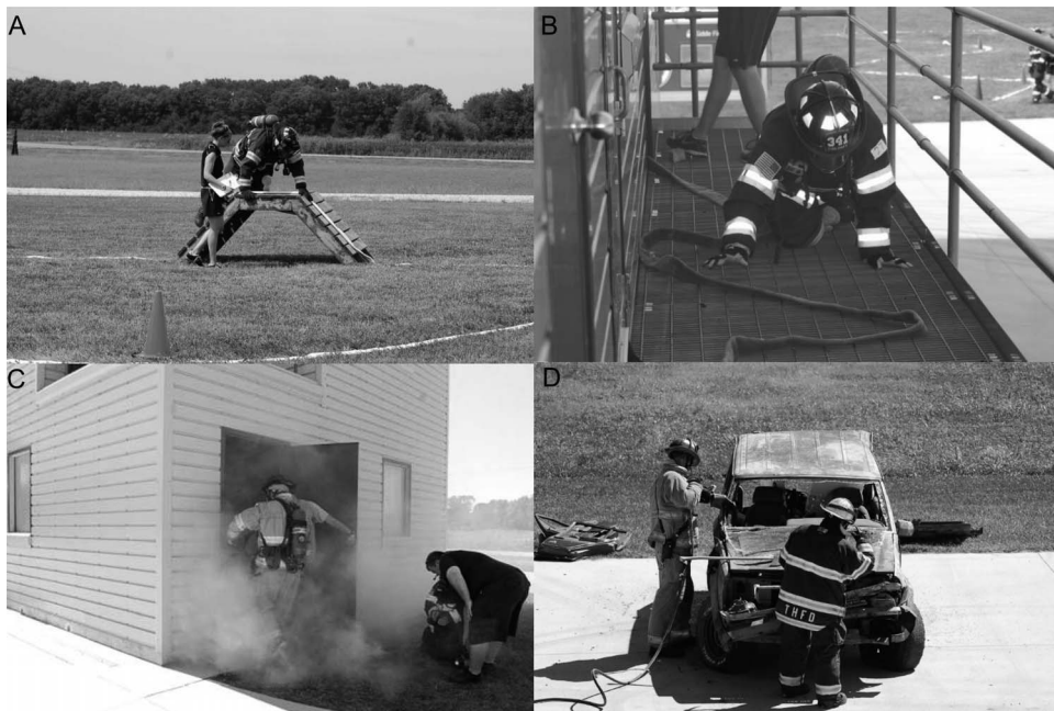
Figure 2. Firefighting activity drills. A, Obstacle course. B, High-rise drill carry. C, Search and rescue (outdoor portion). D, Car extrication.

this time. After the exchange, the firefighters rotated to the next drill in the sequence. They then reported to the RHB area, where all groups rested for 15 minutes by sitting in the shade; removed their SCBA, helmet, hood, gloves, and jacket; and lowered their trousers. The RHB did not begin until all participants were seated on benches (HC and CON groups) or chairs (FC). This RHB procedure is consistent with national recommendations. 15 Firefighters drank tepid water ad libitum. At the end of RHB, firefighters redressed and completed the drill-exchange-drill-rehabilitation sequence a second time.