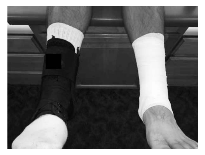
Figure 1. Bracing and taping conditions.

Each volunteer reported to the athletic training room before and after football practice for 1 testing session, signed an informed consent form, and completed the preparticipation questionnaire. Range of motion and dynamic balance were assessed 3 times on each leg throughout the testing session: baseline (before the tape or brace was applied), pretest (immediately after the tape or brace was applied), and posttest (immediately after football practice). Each participant wore each prophylactic ankle support during a single practice: lace-up ankle brace on 1 leg and self-adherent tape on the other. Limb dominance was assessed by asking participants which leg they would use to kick a ball. The tape condition was applied to the randomized condition (dominant or nondominant) and the lace-up brace was applied to the opposite limb (Figure 1).